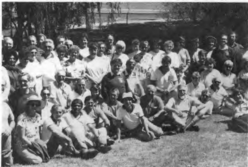
Picnic lunch at Kojonup - South West Tour

With some help from the South West Music Society, the Bunbury audience in the Mechanics' Institute Hall was reasonable but short of expectations. With no local supporting group, numbers for the matinee and evening shows in the beautiful Albany Town Hall were even more disappointing.