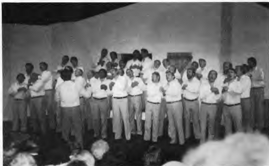
The first concert presentation - Subiaco Theatre Centre, April 1985