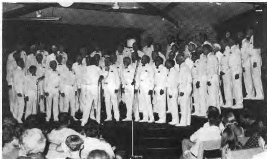
North Perth Baptist Church

For the most part, the Royal Commonwealth Society Hall had proved a very suitable rehearsal venue but some problems had arisen with noise from other activities and availability. When a rent increase was proposed Men in Harmony located an alternative venue at Saint Nicholas Anglican Church Hall, Floreat and the move, including the shed, was carried out at the end of January.