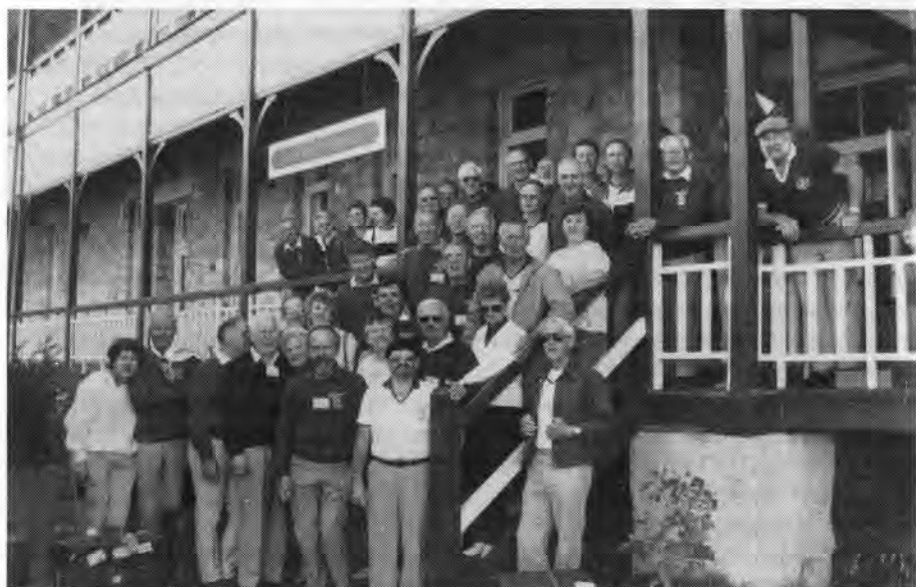
At the Bill Sewell Centre, Geraldton

Men in Harmony shared the program at the beautiful Queen's Park Theatre with the Geraldton Choral Society Choir. It was a first class venue and a great show. Support was less than hoped for but was adequate.