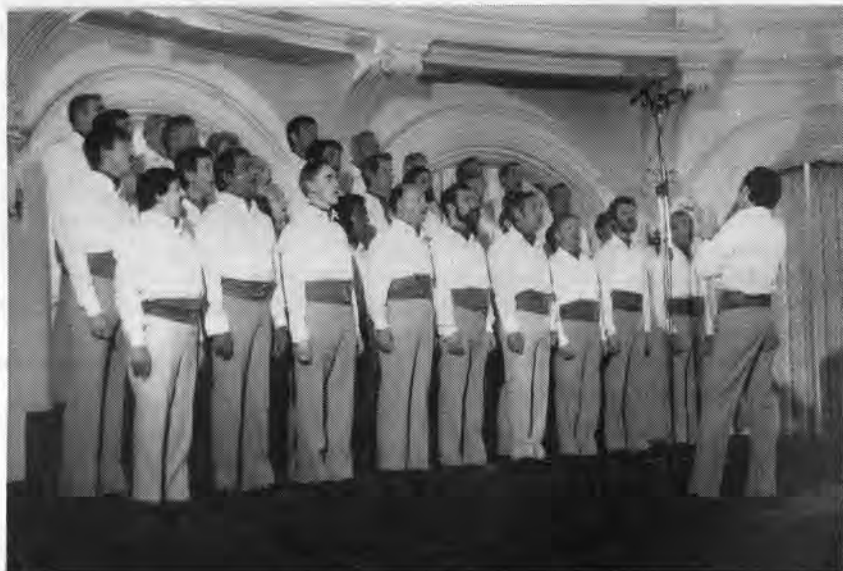
Government House Ballroom - October 1985

With membership steadily growing, on Sunday afternoon, October 13, Men in