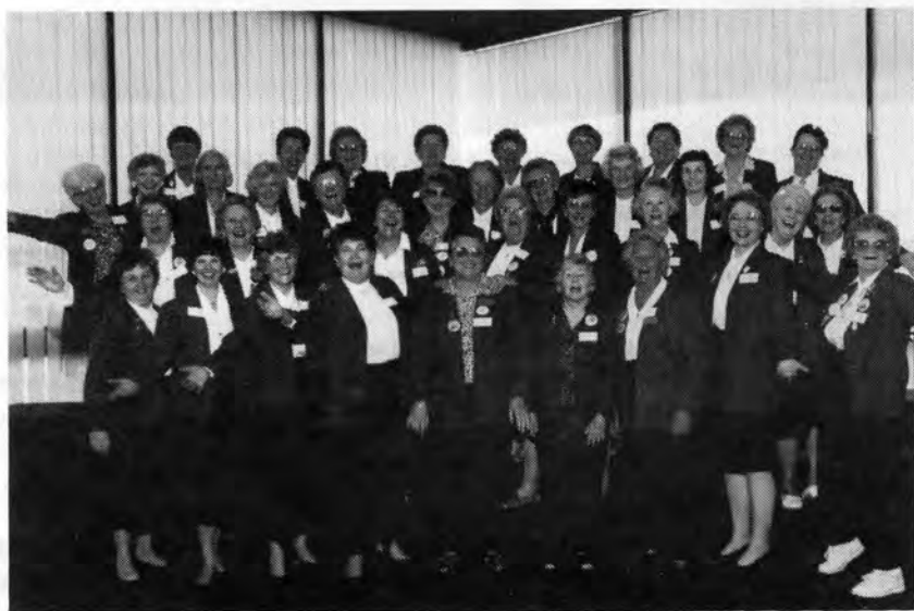
Partners in Harmony