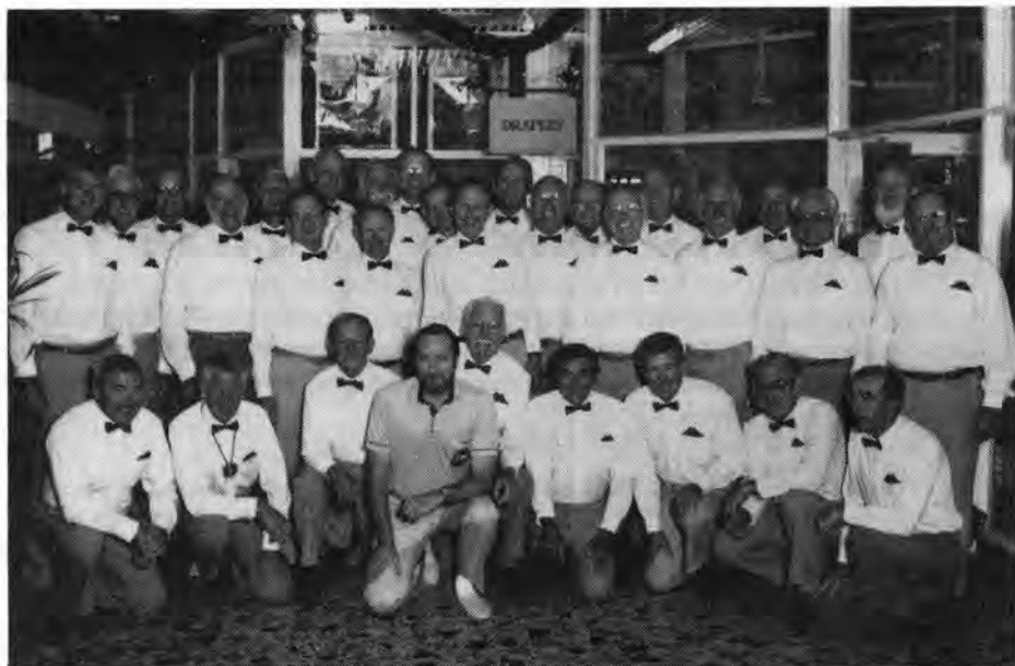
Wembley Downs Shopping Centre